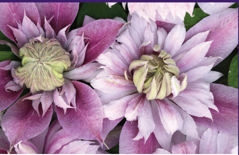
JOSEPHINE Regal® Evijohill® This variety has flowers with 6-8 base petals which are almost bronze, tinged with green and a darker bar, inner petals are lilac with pink bar. As the flower ages the base petals fall away giving a pompom effect. Blooms June through August. Grows to 8'. □