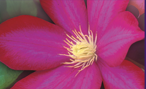
BOURBONTM Gardini® Evipo018® An Evision/Poulsen cultivar which has stunning, vibrant red 5-6" flowers. The round shaped flowers have contrasting yellow anthers. Ideal plant for container growing as its height is only 4-6'. Blooms June through early August. ■