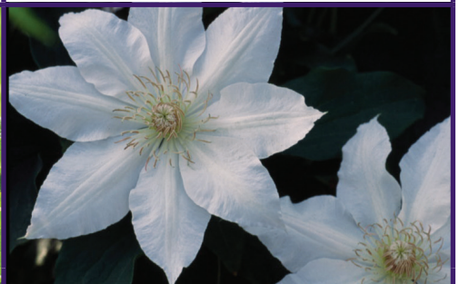
HYDE HALL<sup>TM</sup> Gardini* Evipo009* This compact clematis is ideal for containers. Its 5-7" flowers are off-white with sometimes green or pink tinges. It blooms on the previous season's stems from May to June. Anthers are light chocolate brown.

This bush clematis produces an abundance of 1" indigo flowers in large clusters. Great for cut flowers, slightly fragrant and attracts butterflies. Blooms summer through early fall and produces fluffy seed heads following bloom time. Grows to 2-3'.