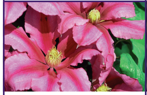
LIBERATION <sup>TM</sup> Evifive ® Liberation is a large 5-6" deep pink flower with a broad cerise central bar with contrasting yellow anthers. Blooms May through June and August through September. Free flowering and strong growing. 0