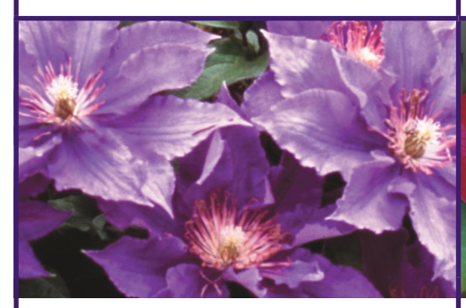
BIJOU<sup>TM</sup> Tudor® Evipo030® An Evison/Poulsen cultivar raised in Guernsey by Raymond Evison in 2005. Small pointed ruffled petals in pale violet/ mauve with slight pinkish bar. Pink tipped anthers open to a lovely rosette shape. Very free flowering and flowers keep shape well. Blooms May through July. Nice low mounding clematis (2 feet).