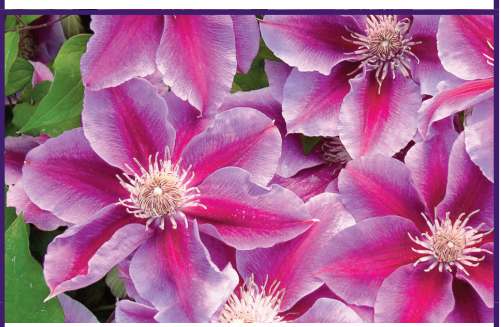
KILIAN DONAHUE The early flowers open ruby red at the center of the flower, fading to brilliant fuchsia and then orchid color at the edge of each petal. The flowers fade to lavender with a pink bar. Its dancing white anthers are burgundy tipped. It is an early bloomer and is a great repeat bloomer throughout the summer months.