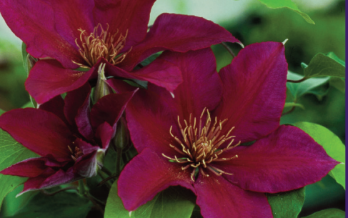
PICARDY™ Tudor® EvipoO24® A very free flowering pretty, 4" red/purple flowers that have added reddish brown anthers. Suitable for container growing as it is a great bloomer and blooms all along the stem. It grows to a height of 4 feet and blooms June through August. ■