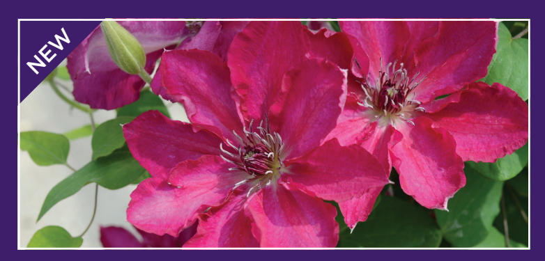
TEKLA<sup>TM</sup> Garland Evipo069(n)

A superb repeat blooming clematis that performs so well year after year. Compact, free flowering produces an abundance of pale violet flowers that are 4" across with wavy-edged petals and attractive red anthers. Bloom time early summer to late autumn. Grows to 4 ft.