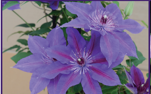
EDDA Boulevard* Evipo074* Good plant for growing in pots or containers due to its compact free flowering habit. Each flower has 6-10 petals. The central petals are shorter and paler in color, the outer petals being purple with a darker reddish purple central bar. All have pointed tips. The plant is repeat flowering from late Spring until early Autumn. Grows to a height of 3-4'. ■