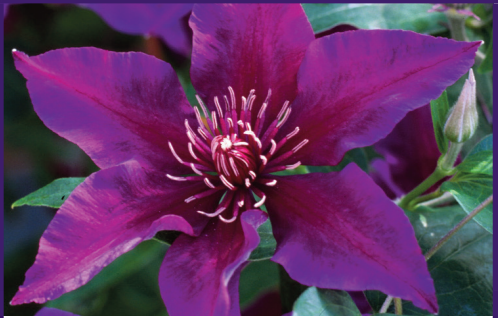
FLEURI<sup>TM</sup> Boulevard® Evipo042® This Evison®/Poulsen® cultivar has deep purple flowers and an attractive contrasting flower center. It is very compact and does well in containers. Fleuri has 5" flowers and grows well in partial shade to a height of 4 feet. It blooms May through August. •