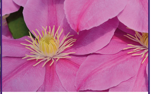
ALAINA<sup>TM</sup> Tudor* Evipo056* The large 5-7" flowers open deep creamy pink and fade as they mature which gives range of shades of pink. The six broad petals are round and are sometimes slightly twisted, the center has contrasting yellow anthers making a very attractive flower. Grows to a height of 4-5' making it a great choice for a container or small garden. Grows well in shade. Blooms June through July and late August/September. ♀