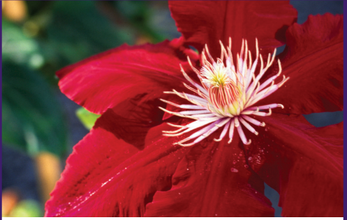
REBECCA<sup>TM</sup> Boulevard® Evipo016® An Evison/Poulsen cultivar with very large flowers that are stunningly bright red (almost scarlet) with creamy yellow anthers. It is exceptionally free-flowering. Blooms May through June and August. ♥