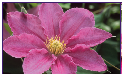
ABILENE<sup>TM</sup> Boulevard* Evipo027* A delightful pink flower with contrasting yellow anthers. As clematis Abilene's flowers mature and fade, a central deep pink stripe becomes more prominent. Can be grown as a patio pot and in partial shade! Blooms in June and again in August. •