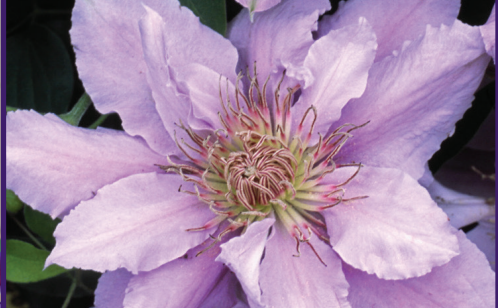
FILIGREE<sup>TM</sup> Tudor® Evipo029® An Evison/Poulsen cultivar raised in Guernsey by Raymond Evison. Silvery blue colored petals, ruffled edges single and semi doubles with red/brown anthers. Exceptionally free flowering. Blooms May through July. Nice low mounding clematis (2 feet).