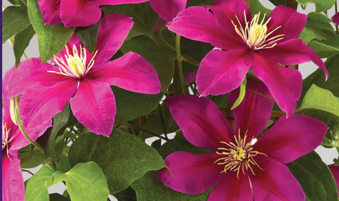
ACROPOLIS<sup>TM</sup> Boulevard Evipo078* A compact very free flowering clematis. It produces an abundance of bright pink flowers that are 3-4 inches. Blooms early summer through late autumn. Acropolis is very showy and grows to 4'. •