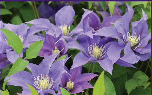
OLYMPIA<sup>TM</sup> Boulevard Evipo 099(n) Has attractive, blue single (and sometimes semi-double) blooms, with overlapping petals and yellow anthers. It flowers off the new and old growth. Very free and repeat flowering, producing flower buds from the leaf axils and end of stems. Ideal for growing in containers on the patio. Grows 3-5'