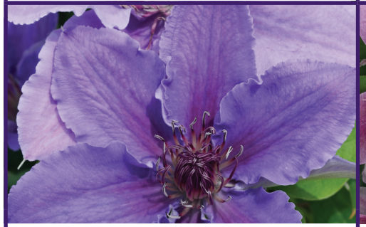
INES<sup>TM</sup> Boulevard® Evipo 059 This compact, free flowering clematis produces 4" flowers that are lavenderblue with wavy edges and a red bar on each petal. Its full red/grey anthers are contrasting and eye-catching. Great for growing in a container due to its repeat flowering. Blooms early to late summer and again in the fall. Grows to 4'.