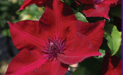
NUBIA Boulevard® Evipo079® This very free flowering clematis has stunning dark red flowers and dark red anthers. This photo is true to color! Flowers are 5" in size and grows to 5'. It blooms June through August and again in September. Blooming comes from along the whole stem so blooms appear from top to bottom of plant. It is pruning type 3 so takes a hard prune in early spring.