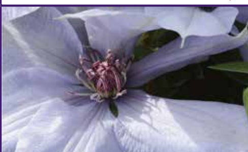
BERNADINE™ Boulevard* Evipo061* This stunner produces masses of large light blue flowers with contrasting red anthers. It's amazing how many flowers it puts out in one blooming! Can be grown in full sun or partial shade. Grows to a height of 6' and blooms June through September. □