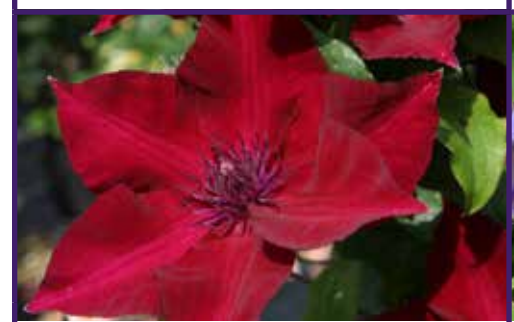
NUBIA Boulevard® Evipo079® This very free flowering clematis has stunning dark red flowers and dark red anthers. This photo is true to color! Flowers are 5" in size and grows to 5'. It blooms June through August and again in September. Blooming comes from along the whole stem so blooms appear from top to bottom of plant. It is pruning type 3 so takes a hard prune in early spring.

LINDSAY<sup>TM</sup> EviGsy ( PBR ). Very large blue/purple spring flowers, some 6-7 inches in diameter with deep red anthers. It is free and repeat flowering in habit, blooming in June & July and again in late August. Ideal to grow in containers or small trellises. Grows to height of 6-8 feet. Prune to 12 inches in February/March.