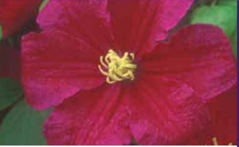
BARBARA HARRINGTON An exceptional late, free flowering plant. Raised from clematis Comtesse de Bouchaud and retaining its parent's ability to flower well over a long period. The cerise colored flowers, approximately 4" in size, have pointed petals with a dark border and contrasting yellow anthers. Blooms late June through September.