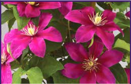
ACROPOLIS<sup>™</sup> Boulevard Evipo078<sup>®</sup> A compact very free flowering clematis. It produces an abundance of bright pink flowers that are 3-4 inches. Blooms early summer through late autumn. Acropolis is very showy and grows to 4'. •