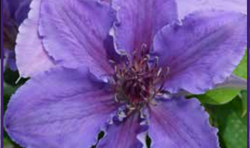
INESTM Boulevard® Evipo059 This compact, free flowering clematis produces 4" flowers that are lavenderblue with wavy edges and a red bar on each petal. Its full red/grey anthers are contrasting and eye-catching. Great for growing in a container due to its repeat flowering. Blooms early to late summer and again in the fall. Grows to 4'.