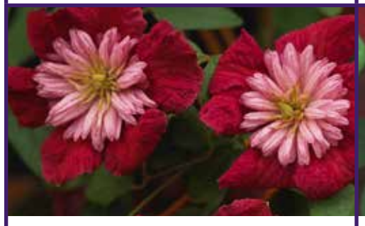
AVANT-GARDE<sup>TM</sup> Festoon* Evipo033* As the name suggests, a very unusual 3" red flower with pink petaloid stamens giving the impression of a double flower and protruding trumpet. Very free flowering. Blooms July through September. Part of the "Evison/Poulsen Festoon Collection." Q