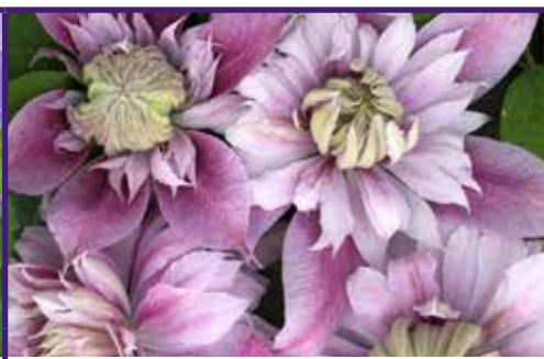
JOSEPHINE Regal® Evijohill® This variety has flowers with 6-8 base petals which are almost bronze, tinged with green and a darker bar, inner petals are lilac with pink bar. As the flower ages the base petals fall away giving a pompom effect. Blooms June through August. Grows to 8'. 🛭