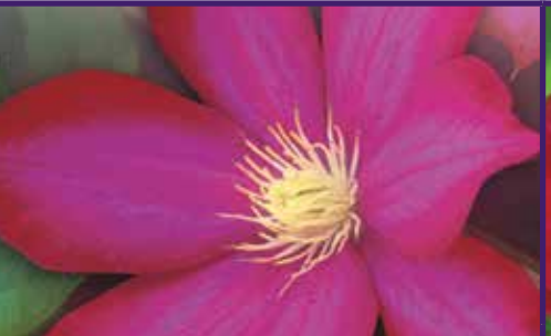
BOURBON<sup>TM</sup> Gardini® Evipo018® An Evision/Poulsen cultivar which has stunning, vibrant red 5-6" flowers. The round shaped flowers have contrasting yellow anthers. Ideal plant for container growing as its height is only 4-6'. Blooms June through early August. □