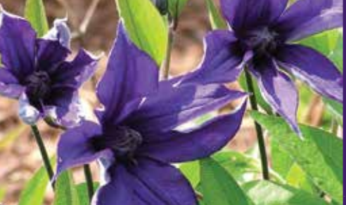
SAPPHIRE INDIGOTM Cleminov51 PP#17012 This unique clematis stays true to name with long lasting dark purple blooms that fade to deep blue with stunning dark purple to black anthers. It is a continuous bloomer June through September. It can be trained as a climber to a height of 4' or grown as a shrubby ground cover with no support. Good choice for containers. It can be grown in partial shade.