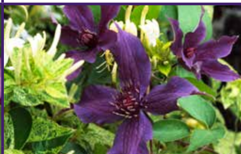
GUIDING PROMISE<sup>TM</sup> Evipo053 (N) This is a short-growing clematis ideal for growing in a mixed border with other plants or in a container. It grows to about 3-4ft in height. It is multi-flowering producing mauve-purple flowers with twisted petals and purple anthers. Blooms May − July and again in Autumn. □